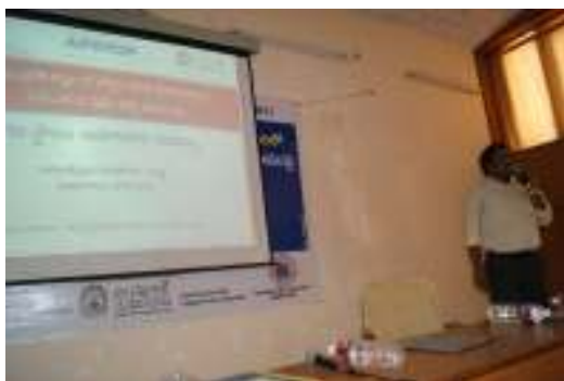
Session During the Programme