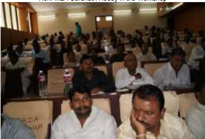
Officials during the workshop