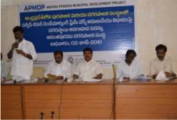
Hon. Mayor welcomed all the guest in to the dais