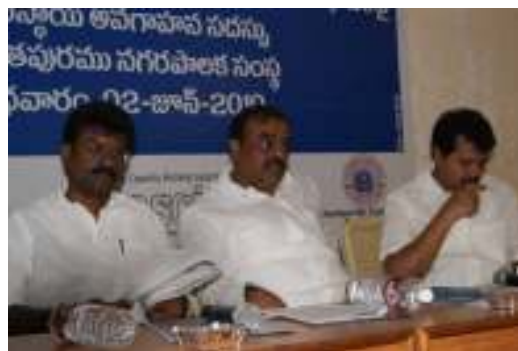
Hon. Mayor, MP and MLA during Workshop