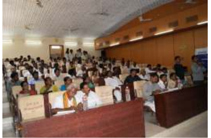
Participants during the programme