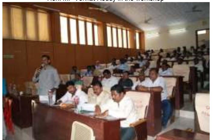
Corporator with a query in the workshop