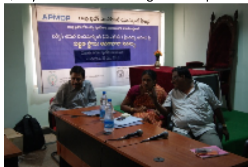
Participants for discussion with officials