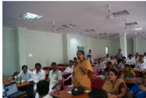
Query of Councillor during workshop