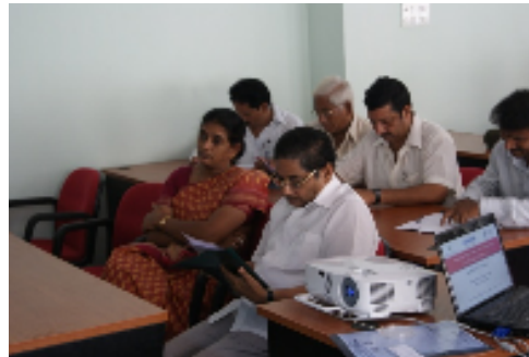
Administrators during the workshop