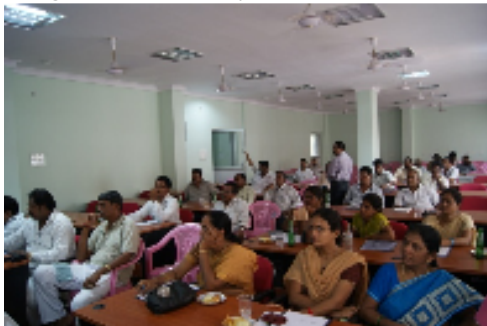
Councillors in the workshop