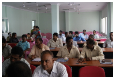
Municipal staff in the Workshop