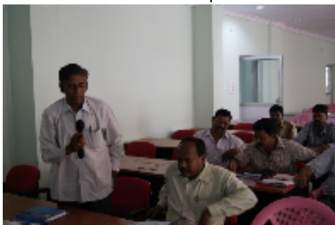
Municipal Staff during discussion with officials